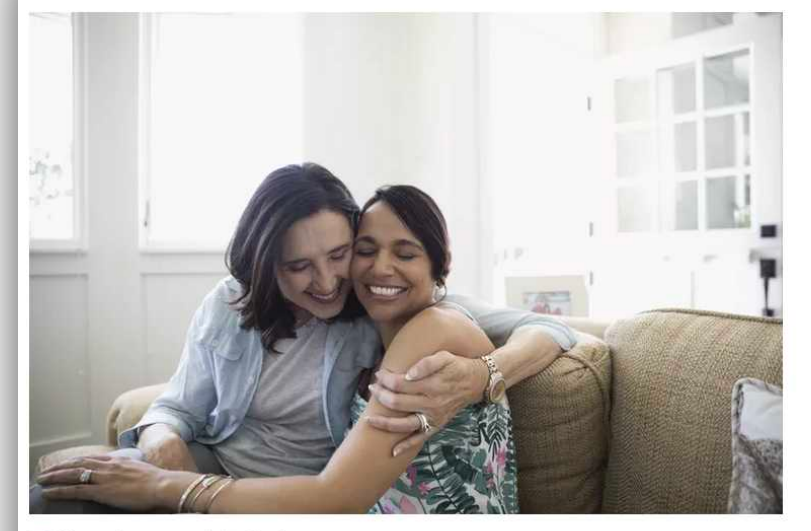
💿 Hero Images / Getty Images